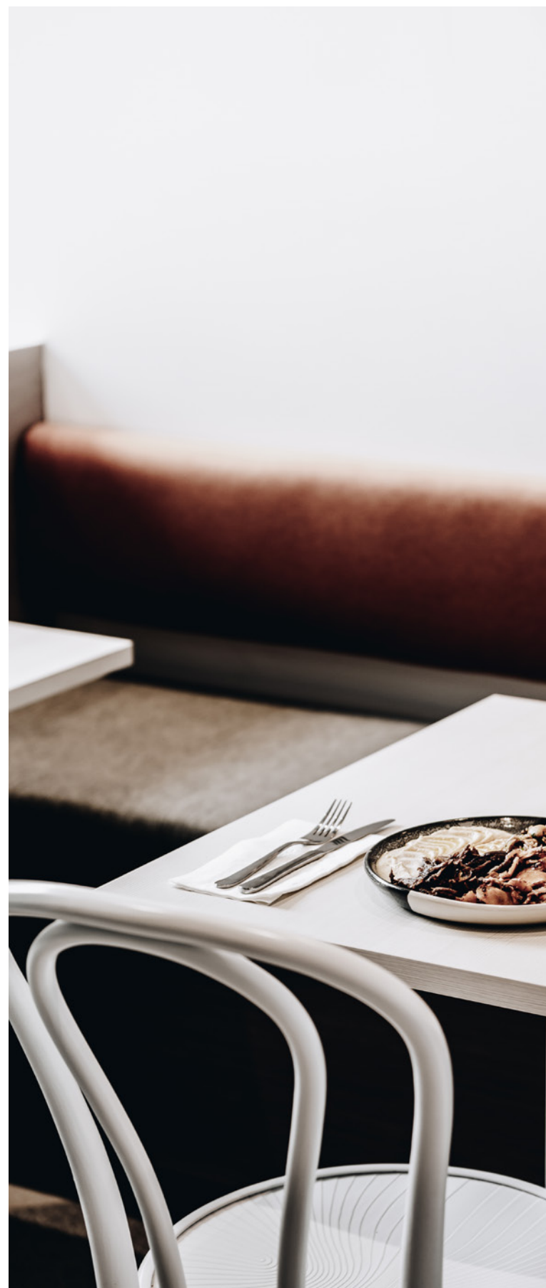
LEFT — Shawarma plate and chips.

Oasis Bakery opened 20 years ago as a humble little Lebanese cake shop in Murrumbena. Since then, it has grown leaps and bounds, expanding into a Middle Eastern café, restaurant, grocery store, deli and cooking school, all run by the dedicated Makool Family. A sure-fire Melbourne institution, its cult following grew so much, the family decided to open a second Oasis in the inner-north.