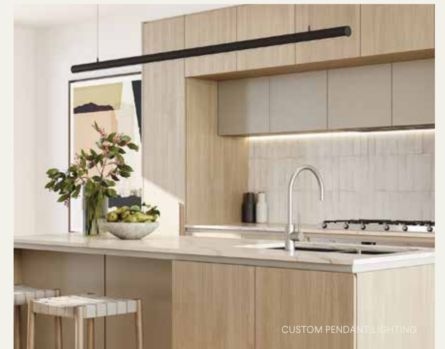
CUSTOM PENDANT LIGHTING

The intricate details and closely measured design decisions transform a space into a home. Carefully composed, the textural elements from the engineered timber flooring, natural timber joinery and 100% wool carpets pair seamlessly with the custom-made, black contemporary lighting pendant in the kitchen. In the bathroom, the porcelain floating vanity is accentuated by brushed nickel finishes and a sophisticated feature wall lamp designed to complement without overpowering.