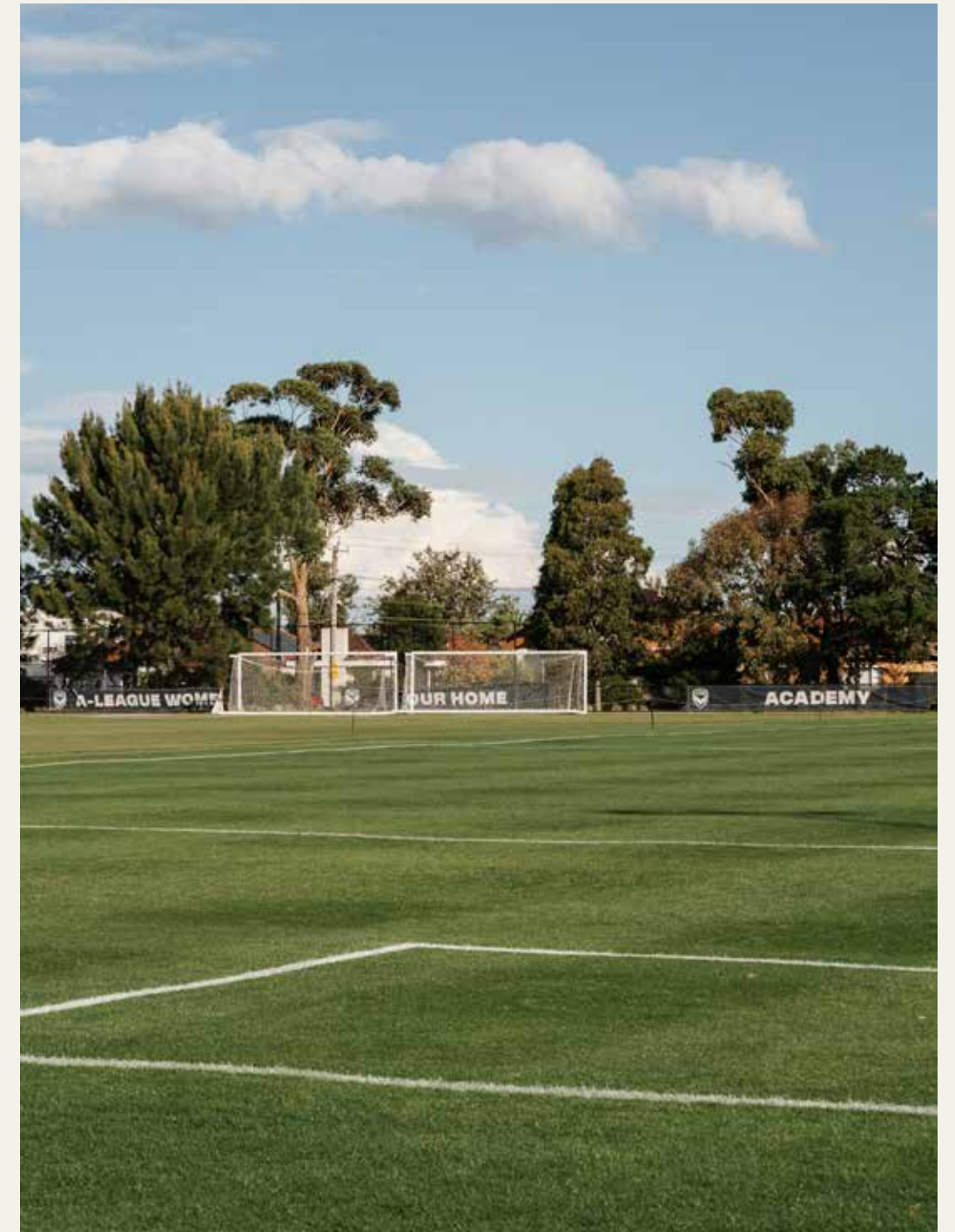
LEFT TO RIGHT MARIBYRNONG AQUATIC CENTRE, ROBERT BARRETT RESERVE