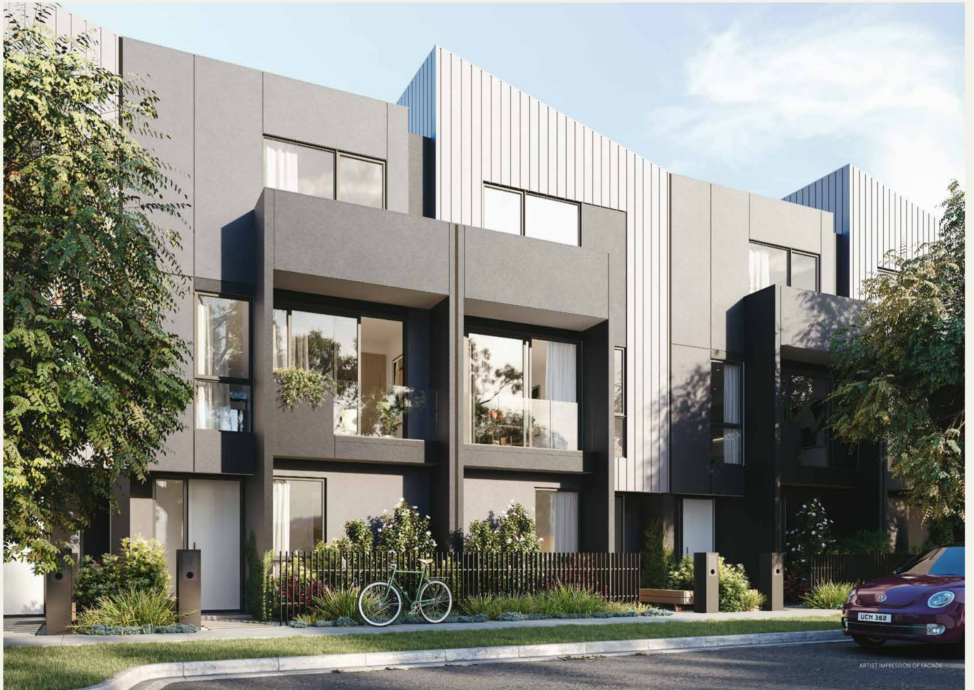
ARTIST IMPRESSION OF FACADE