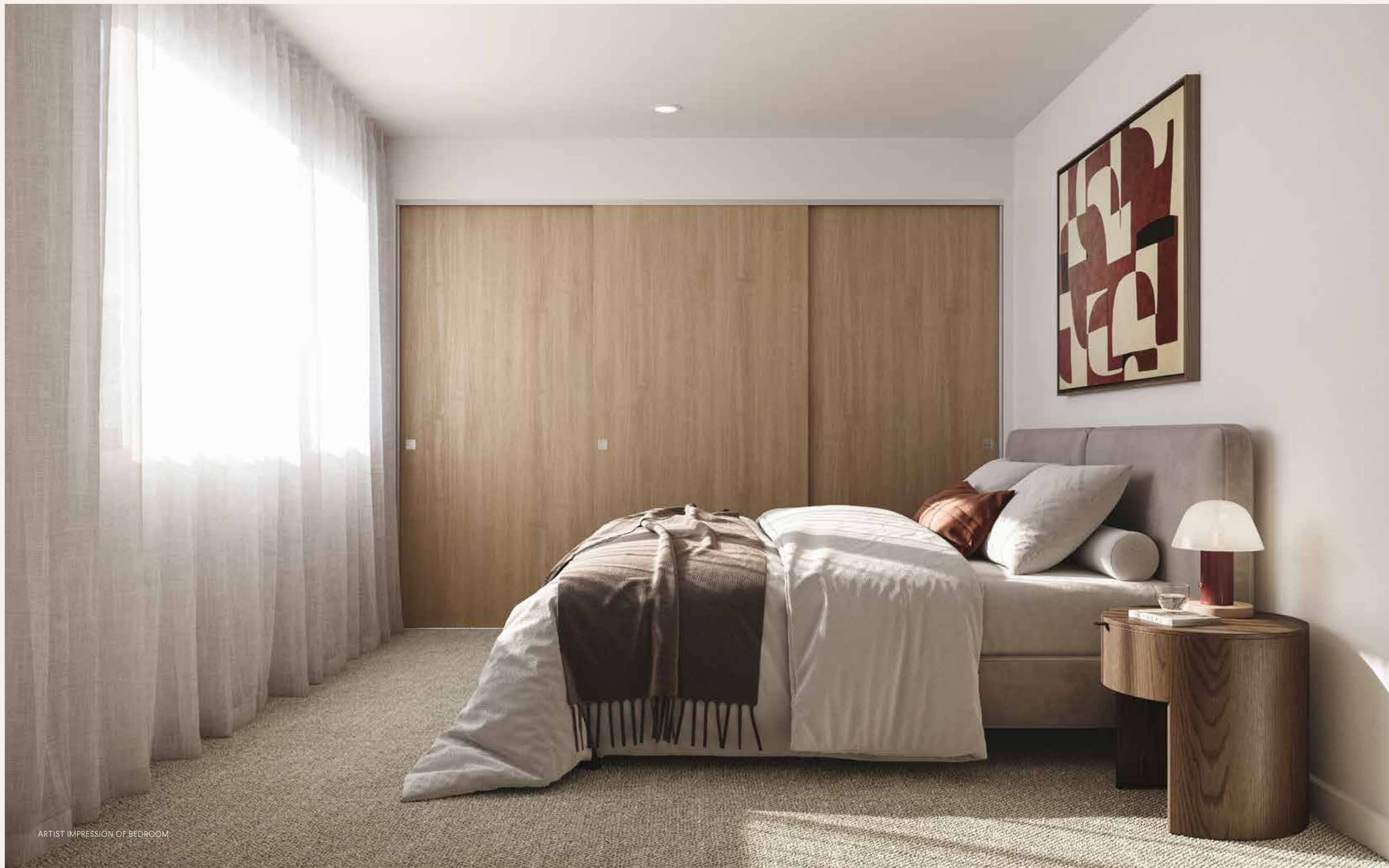
ARTIST IMPRESSION OF BEDROOM

Defined by an elegant, minimalist aesthetic, the well-appointed and light-filled bedrooms are the epitome of family living. Intertwining functionality with a timeless design philosophy, these spaces are tailored to suit your lifestyle, whether you're in need of an additional work space or hosting guests over the weekend.