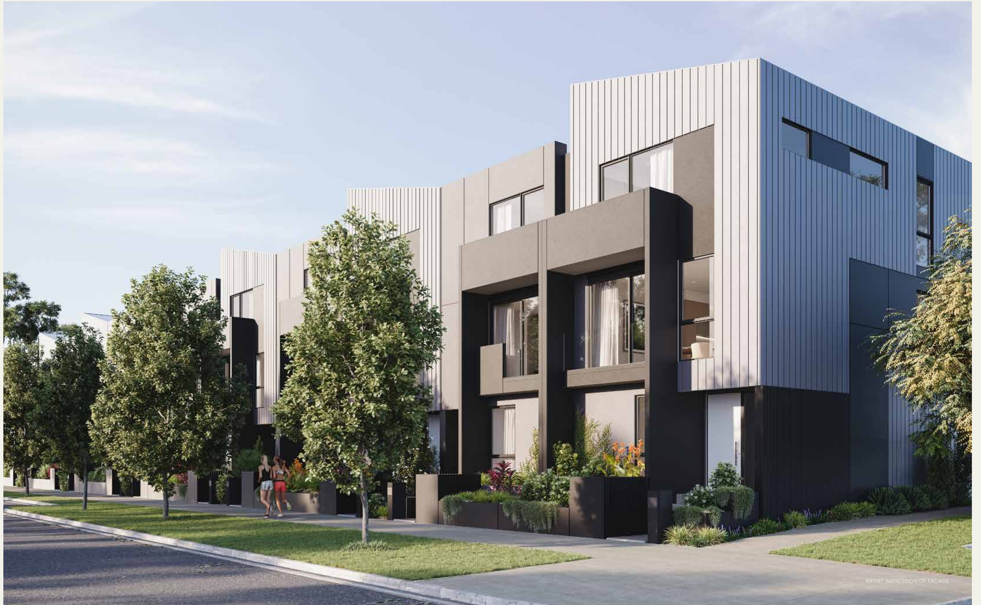
ARTIST IMPRESSION OF FACADE

Winding pedestrian streetscapes are within arm's reach, connecting residents to verdant outdoor spaces with a pre-existing park and recreational space, perfect for walking the dog and entertaining the kids at the playground. The height of privacy and security, spacious garages are afforded to each home, safely navigating vehicles through the rear laneways.