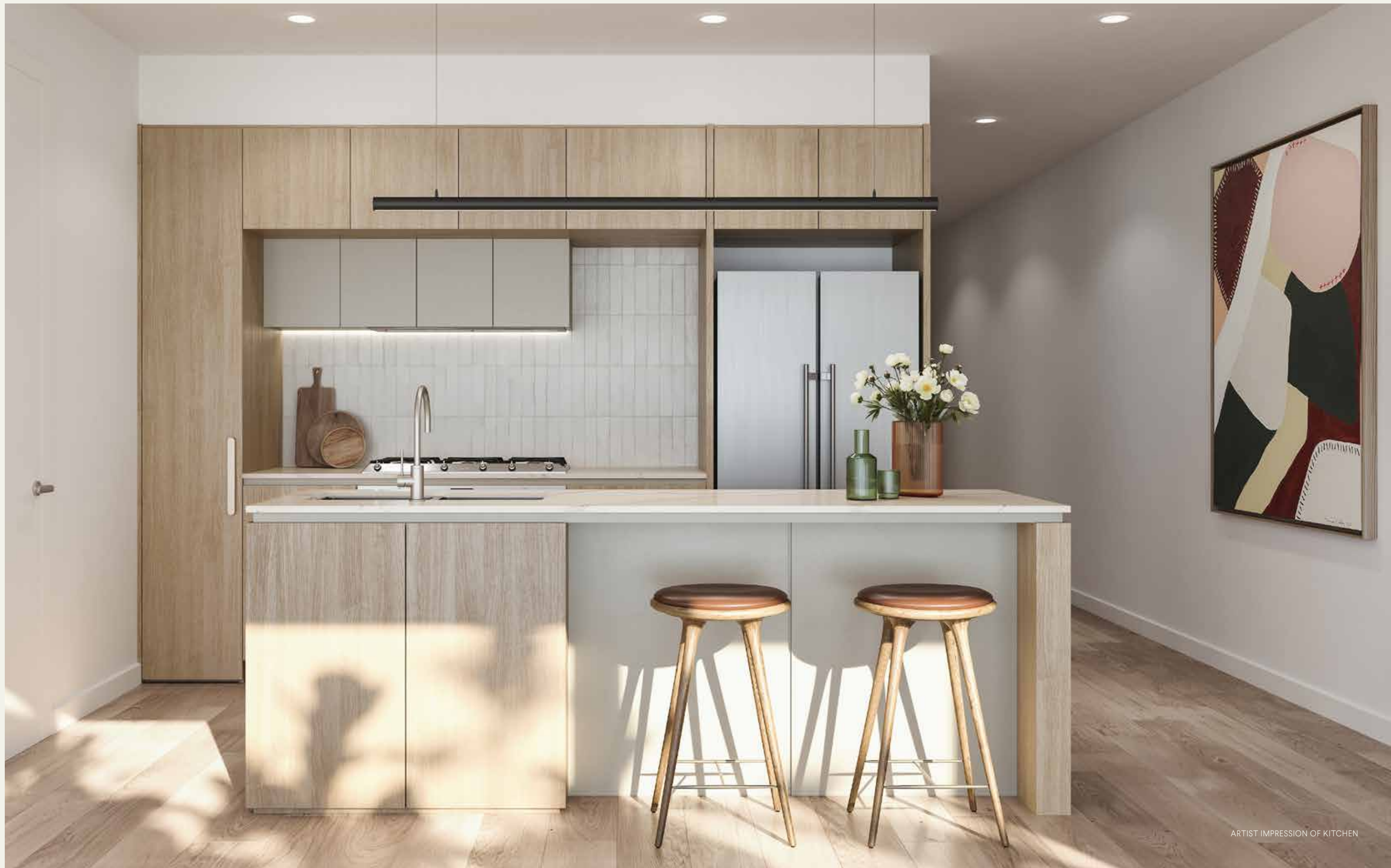
ARTIST IMPRESSION OF KITCHEN

Situated on its own level, Wattle House's kitchen embraces the intersection between style and substance. A premium suite of Smeg appliances harmonises with the timber joinery, transforming daily tasks into moments of inspiration. Fostering family connection and cultivating the perfect setting for entertainment, a bespoke, central island bench is illuminated by hand-selected feature lighting.