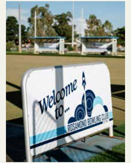
LEFT TO RIGHT ROSAMOND TENNIS CLUB, ROSAMOND BOWLING CLUB, MEDWAY GOLF COURSE

Impeccably maintained recreational facilities and outdoor spaces are speckled around Wattle House, providing an array of opportunities to exercise with a dash of friendly competition. Robert Barrett Reserve offers exceptional sporting grounds for those who love cricket, bowls and tennis. With a reputation as one of the premier golf courses in the area, Medway Golf Club is a historic hub for community recreation. After an afternoon perfecting your swing amongst the recently upgraded surrounds, enjoy a gourmet meal at their quaint clubhouse.