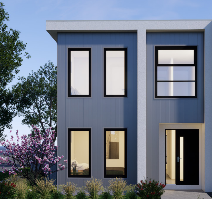
ARTIST' IMPRESSION ONLY