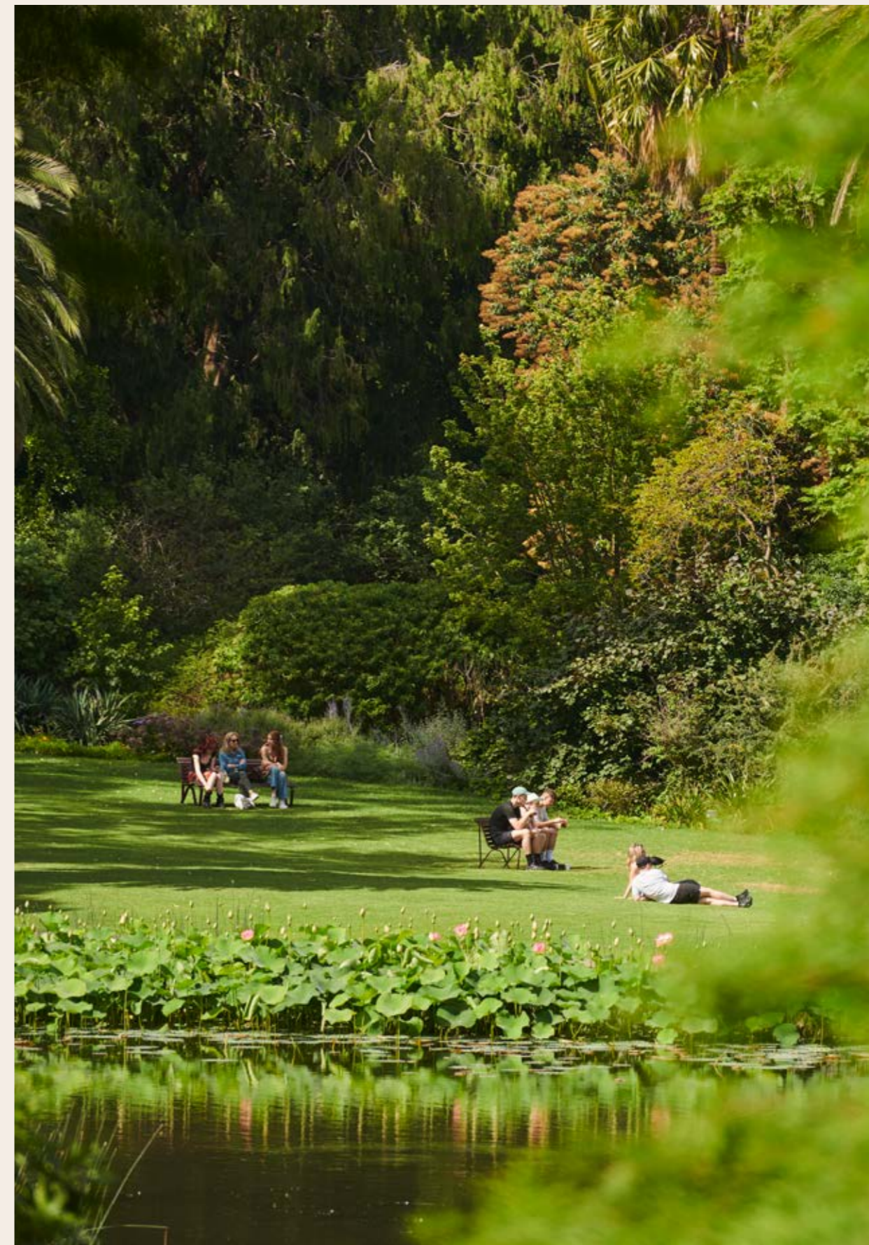
CLOCKWISE FROM TOP YARRA RIVER ROYAL BOTANIC GARDENS THE TAN TRACK